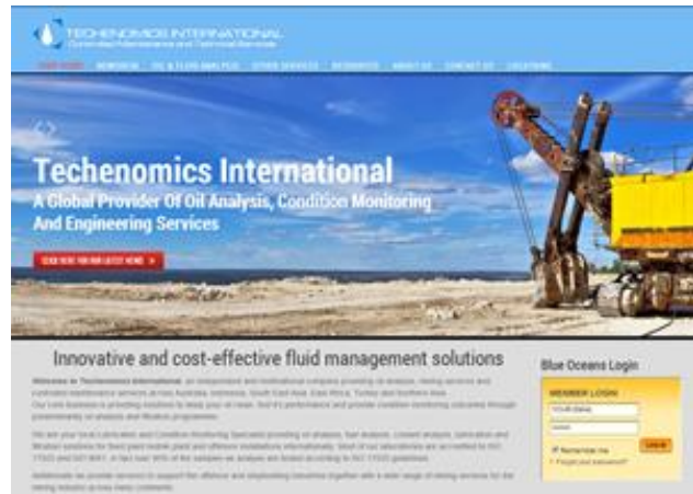
New Web Site

The international site incorporates all of Techenomics offices in Australia, East Africa, Indonesia, Mongolia, Thailand and Turkey. It also features their Total Fluid Management Services, operating six laboratories with either ISO 17025 certification or pending certification and consulting services in Australia, Indonesia and Thailand.