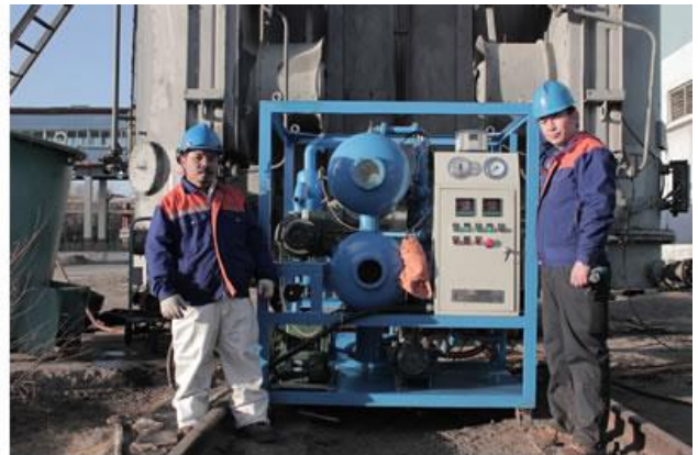
Removes, water, dissolved gases and wear particles

The successful completion of the two day filtration project will have major financial benefits for Power Plant 4 potentially saving them hundreds of thousands of dollars in new oil purchasing costs, identifying minor problems before they become major failures and allowing them to plan future maintenance/monitoring of the transformers.